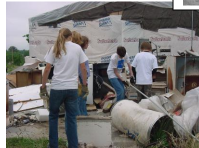
Volunteer Church Group Madison, MO 2006 Tornado