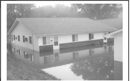
Paris Senior Housing Paris, MO 2008 Flooding